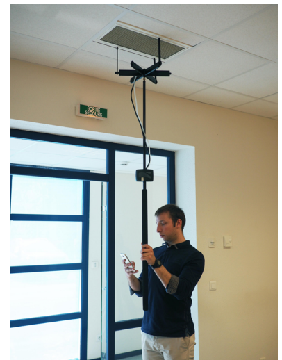
Use with the measurement grid