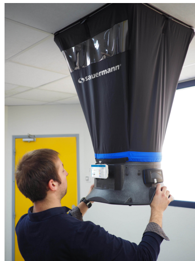
Use of the air flow meter