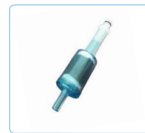
Zero Filter for Calibration (Si-AQ VOC Zero Filter)