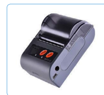
Bluetooth® Printer (Si-AQ Bluetooth® Printer)