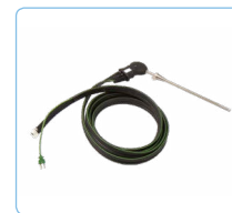
Sampling Probe (Si-AQ Probe with Hose)